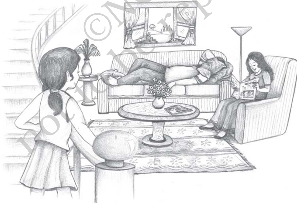
The little girl always found Mother reading and Father stretched out on the sofa.